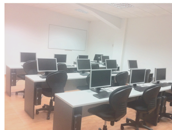
CENTRO DE FORMACIÓN UNITEL AULA DE FORMACIÓN Nº 6