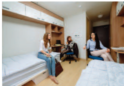
Student Room (Twin)