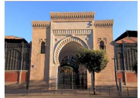
Mercado de Atarazanas