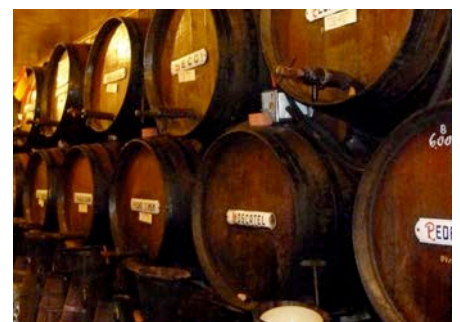
Casa del Guardia