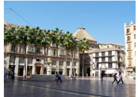
Plaza de la Constitución