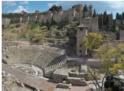
Alcazaba / Teatro Romano