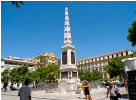
Plaza de la Merced