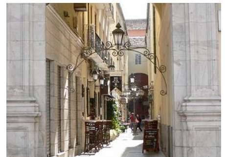
Pasaje de Chinitas