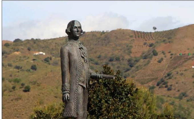
Statue of Bernardo de Gálvez in his hometown, Macharaviaya

This year, the Maria Zambrano Center for Transatlantic Studies has scheduled the 2 nd International Workshop on 16 th and 17 th of June and its main topic will center around the Gálvez family, especially focused on the universal figure of Bernardo de Gálvez.